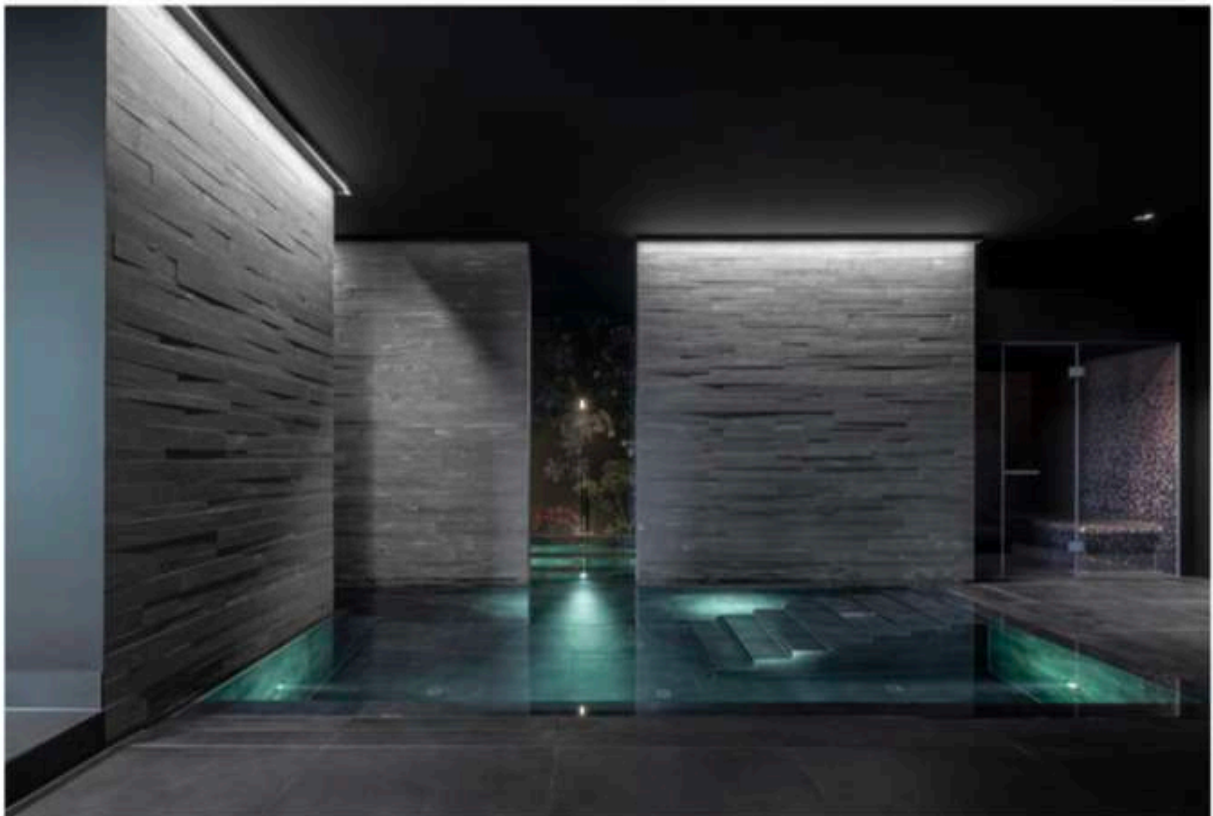
HOLZRAUSCH: HAUS S2

One of our core principles is working with natural, authentic materials. That's why we use a lot of solid wood and wood veneers, always finished with biological surface treatments. We also incorporate natural stone, for example, in flooring, kitchens, or bathrooms, and textiles for wall coverings or in master bedrooms. For walls and ceilings, we love collaborating with an Italian manufacturer that handcrafts clay plasters from natural materials.