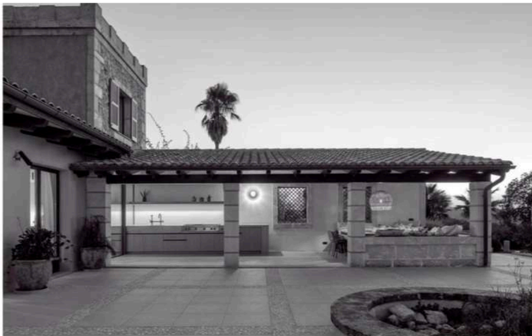
HOLZRAUSCH: MALLORCA – FINCA SONRISA

How long does it usually take to go from your vision to having a project completed?