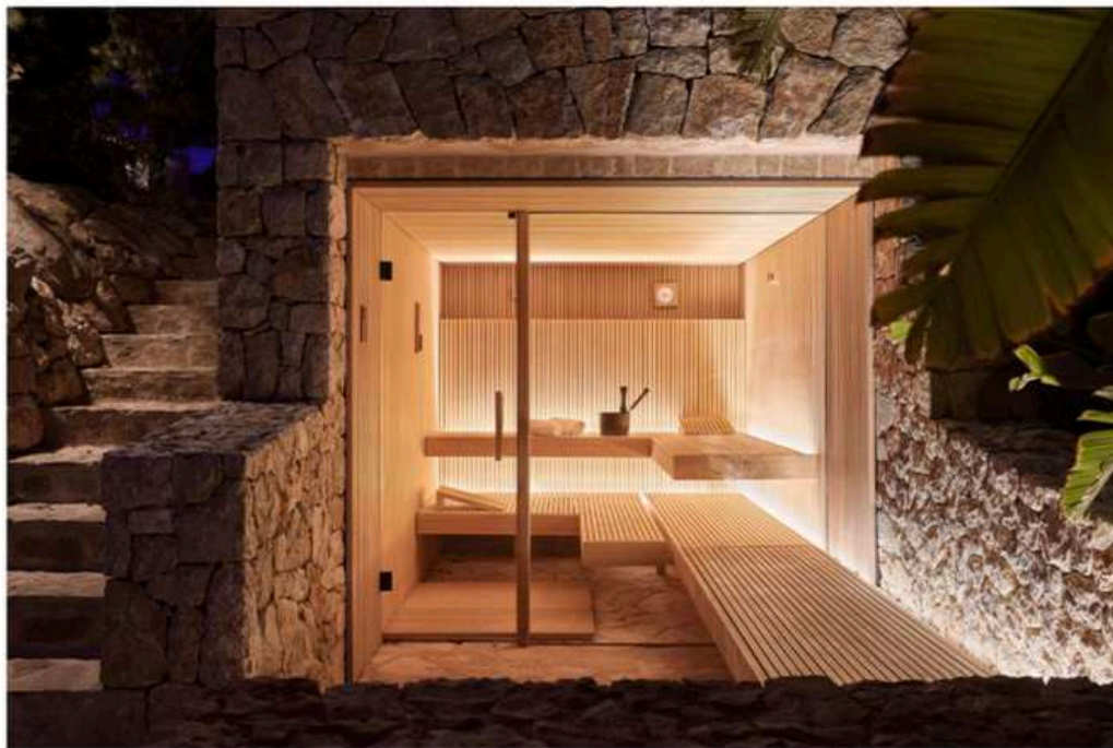
HOLZRAUSCH: MALLORCA – FINCA SONRISA

We draw much of our inspiration from travel. Additionally, European interior design fairs like Salone del Mobile in Milan or Three Days of Design in Copenhagen are essential events for us. At these fairs, we connect with many retailers, suppliers, and partners, and we consistently discover innovative ideas and companies.