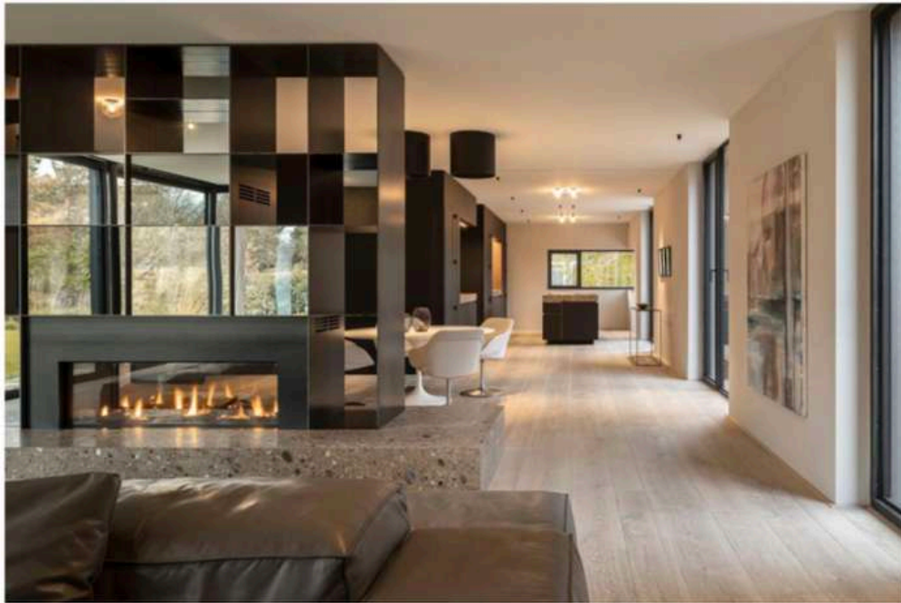
HOLZRAUSCH: MUNICH – VILLA GRUNWALD