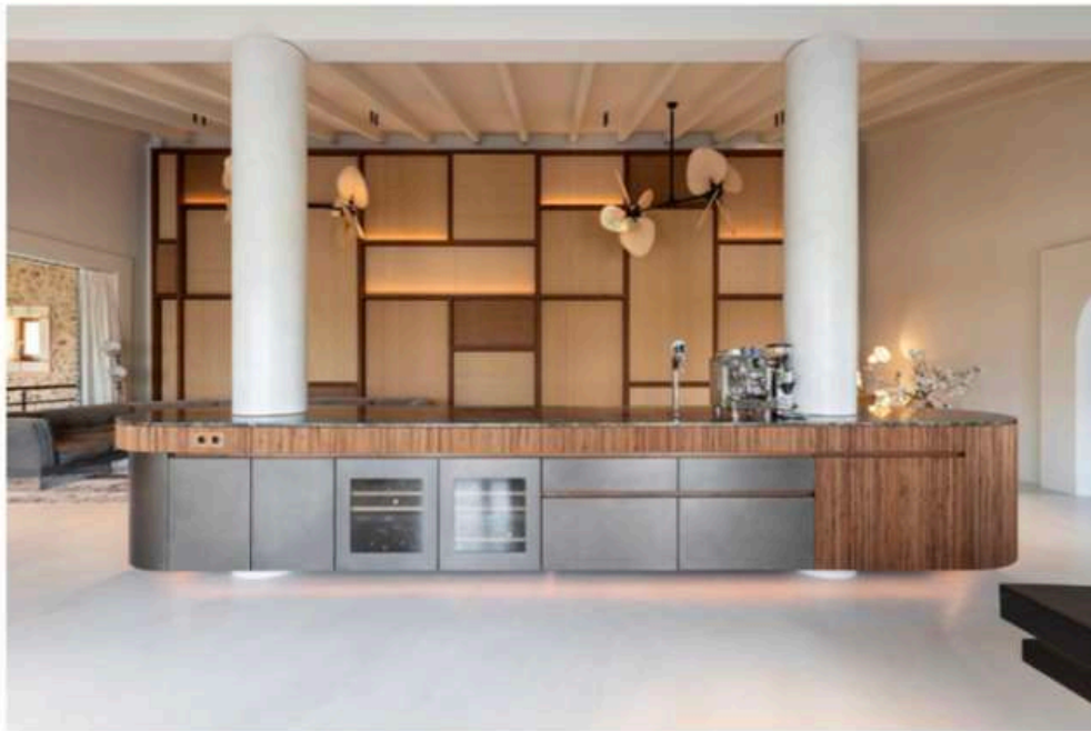
HOLZRAUSCH: MALLORCA – FINCA SONRISA