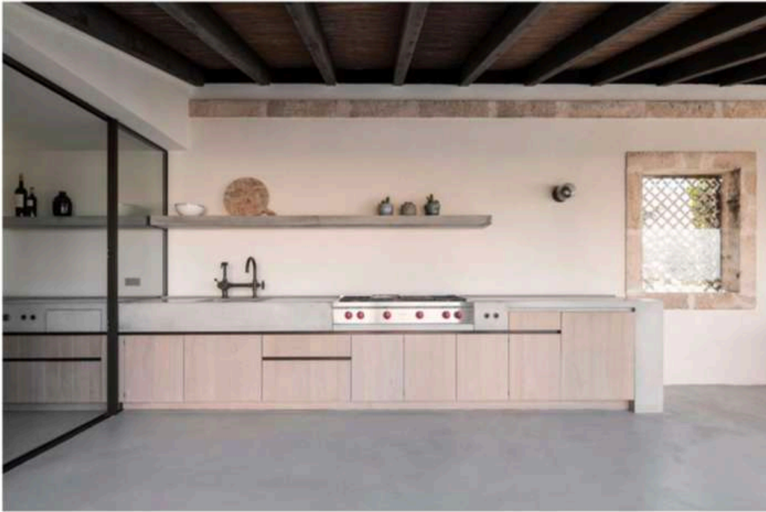
HOLZRAUSCH: MALLORCA – FINCA SONRISA

What are your favorite materials to utilize in your designs?