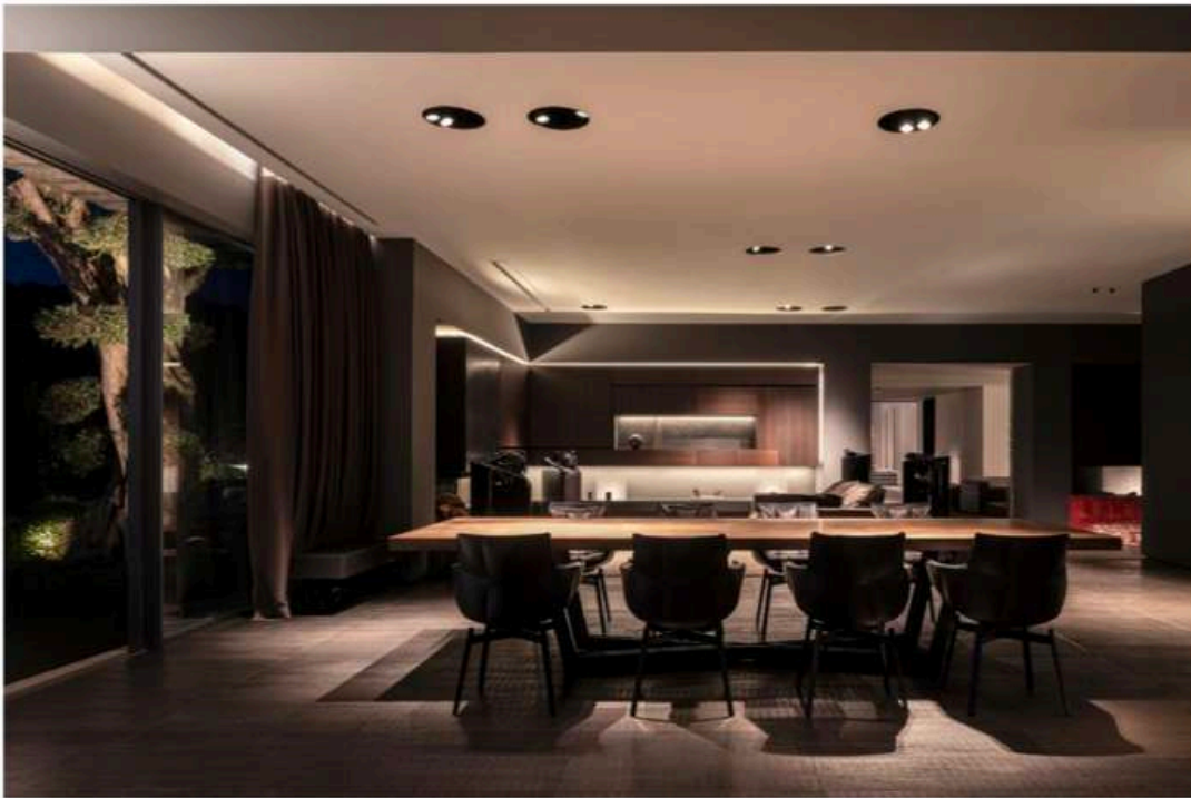
HOLZRAUSCH: IBIZA – CASA BLANCA

How long does it usually take to go from your vision to having a project completed?