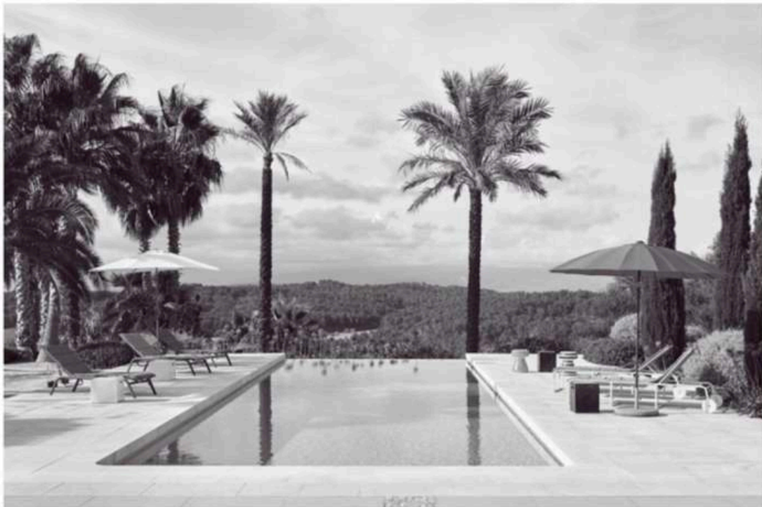
HOLZRAUSCH: MALLORCA – FINCA SONRISA

What are your favorite materials to utilize in your designs?