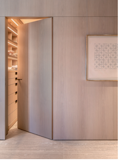
Deli Residence, Miami, Fisher Island

mentation and also develop customised furniture rausch will continue to follow. and lighting. "Translating the essence of a material into the aesthetics of customised architecture is DESIGNS FOR ETERNITY what drives us," sums up Sven Petzold. "We create Everything Petri and Petzold do, they do with a farrooms and furniture that bear a minimalist, timeless sighted view of the day after tomorrow. Not only signature." Everything from a single source – it's so because the selected materials endure and mature easy to say. But the spectrum between system cate- instead of fading. But also, because Holzrausch ring and Michelin-starred cuisine is notoriously wide Studio's designs decidedly do not follow fashions. - it's easy to guess where Holzrausch Studio fits in. Because they endure. Good things do not lose their